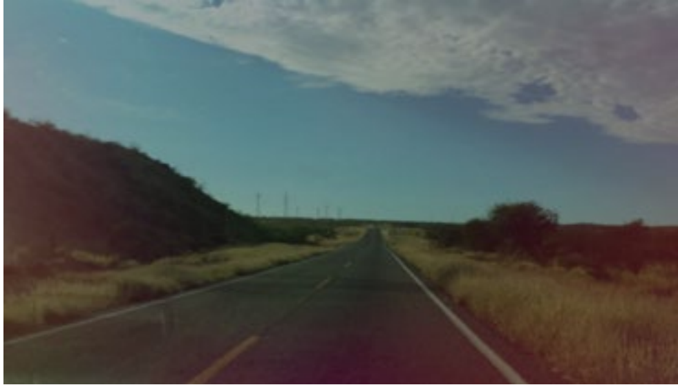
VIDEOSTILL TRAILER FATE (THE BOLAÑO PROJECT)