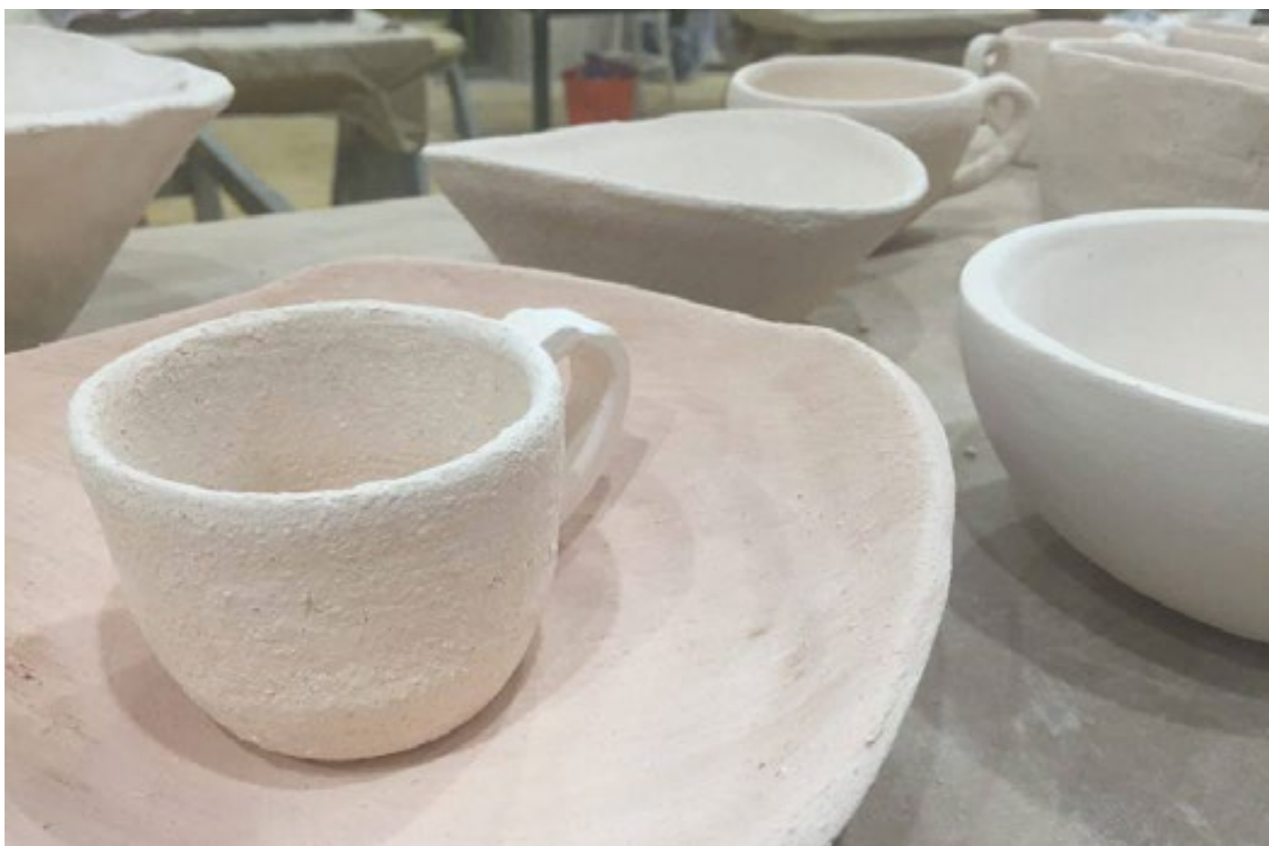
CERAMICA IN PROCESS