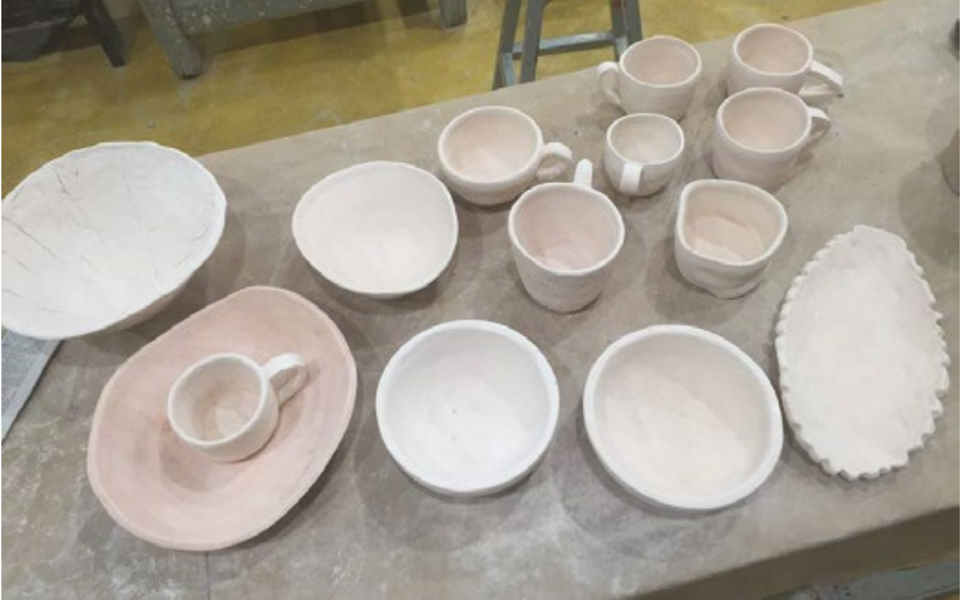
CERAMICA IN PROCESS

FIRST CERAMICA EXPERIENCE DIFFERENT FORMS AND BOWLS