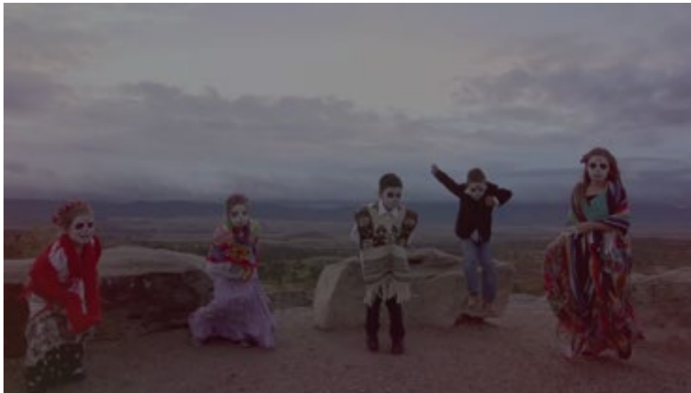
VIDEOSTILL TRAILER FATE (THE BOLAÑO PROJECT)