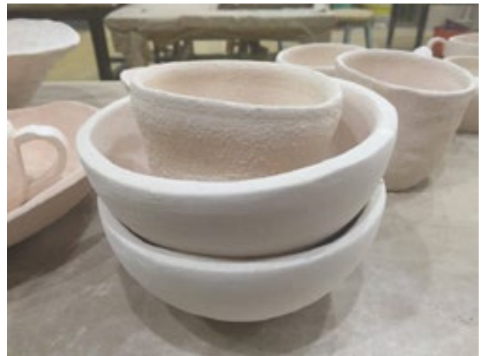
CERAMICA IN PROCESS