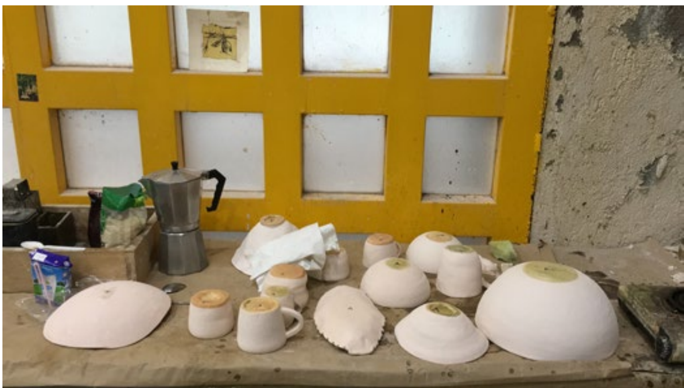
CERAMICA IN PROCESS