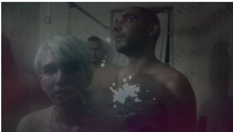
VIDEOSTILL TRAILER FATE (THE BOLAÑO PROJECT)