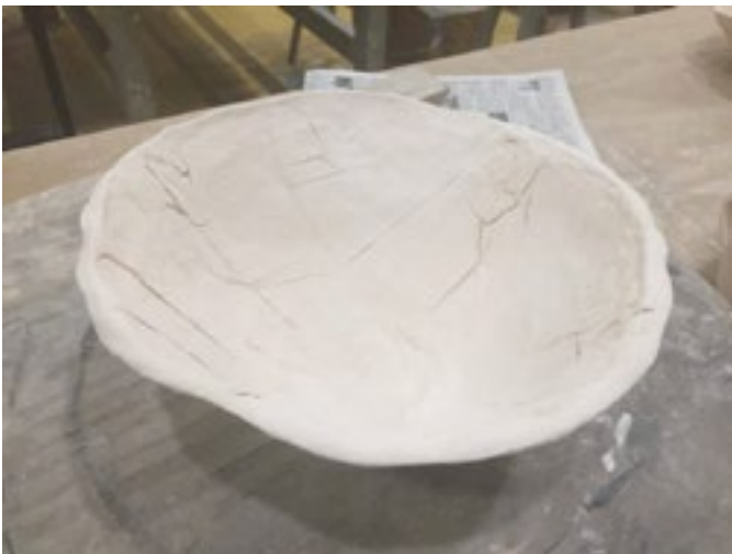
CERAMICA IN PROCESS