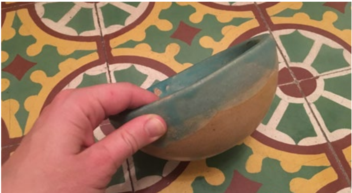
CERAMICA AFTER GLAZING