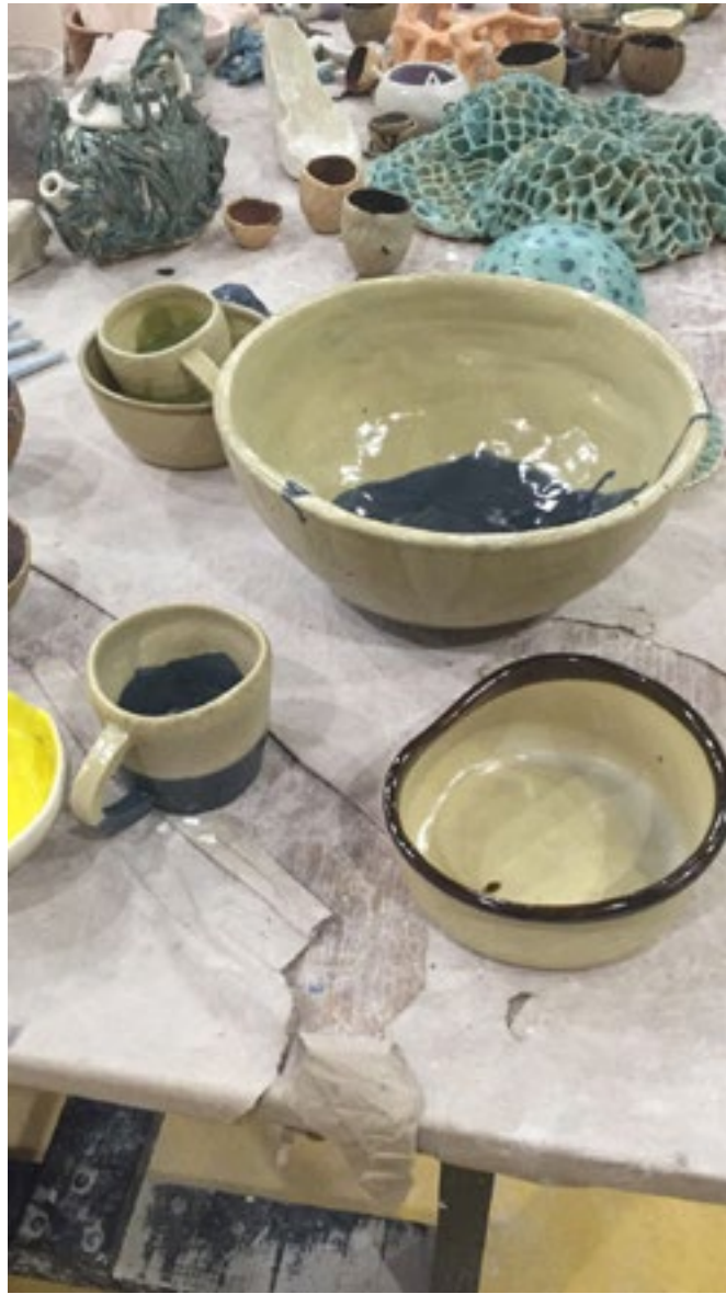
CERAMICA AFTER GLAZING