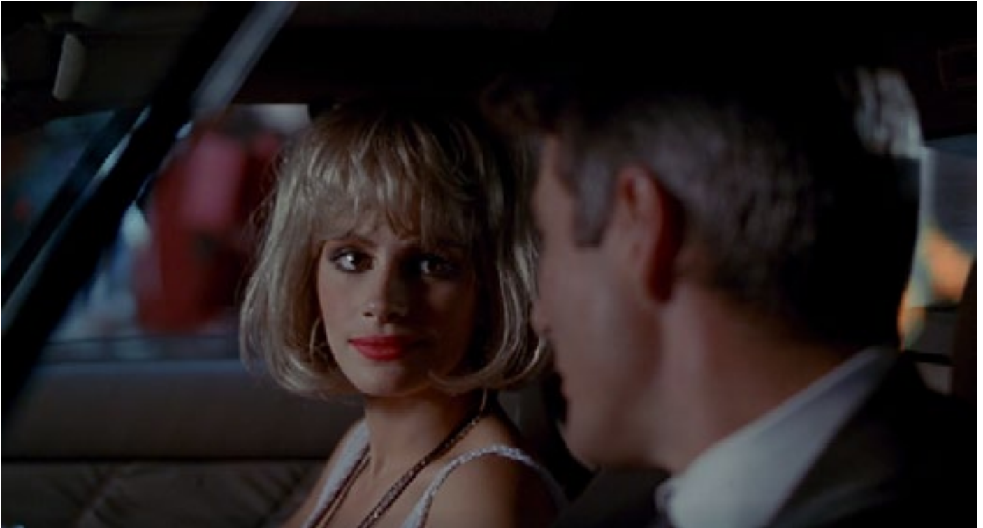
VIDEOSTILL "PRETTY GAZE"

FOUND FOOTAGE VIDEO 16:9 / COLOR / STEREO SOUND 09:09 MIN