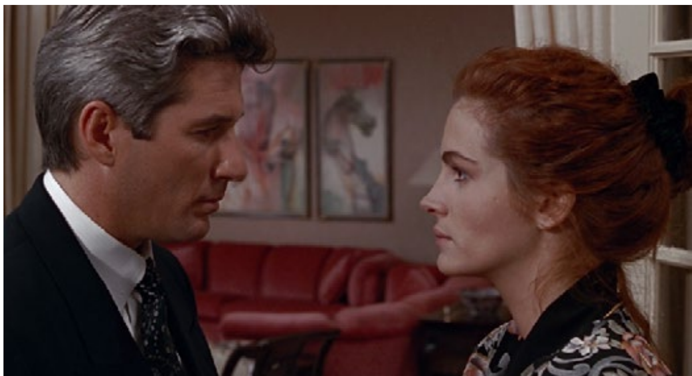
VIDEOSTILL "PRETTY GAZE"